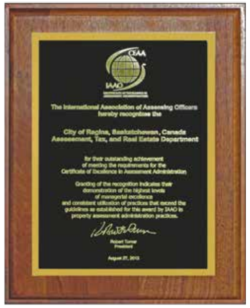
The CEAA plaque recognizes the completion of the certificate program

"The CEAA application process provided an excellent opportunity to analyze every function of our office."