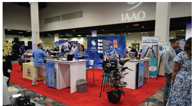
The IAAO booth area at the 2025 Annual Conference