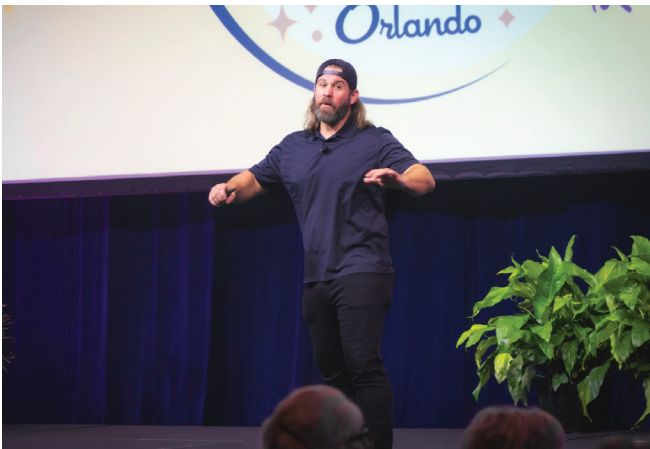
Former NFL player, magician, author Jon Dorenbos was the Keynote speaker at the annual conference.