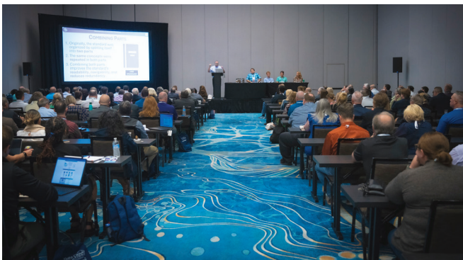
A Panel Discussion on Key Updates to the IAAO Standard on Ratio Studies was among the top attended sessions at the conference.