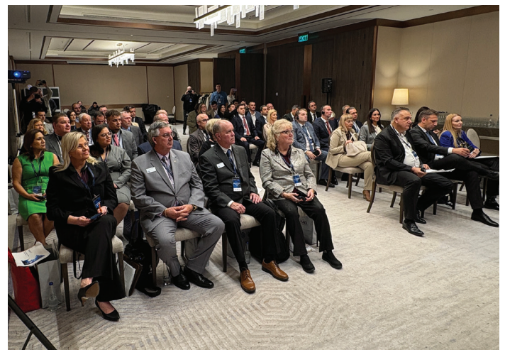
Members of the IAAO Board of Directors and government representatives from 11 countries attended presentations at the Southeastern Europe Chapter of IAAO meeting in Belgrade, Serbia in December 2025.

The SEE IAAO Chapter was formed in 2024 and is the second chapter in Europe. IAAO has 37 chapters, including seven outside the United States.