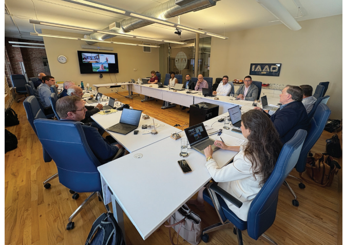
IAAO's Mass Appraisal Experience Task Force and The Appraisal Foundation's State Harmonization Task Force met at the IAAO headquarters in July 2025.

The two groups also talked with Fannie Mae's Appraiser Development Initiative (ADI) to discuss a potential partnership regarding opportunities for ADI scholarship recipients to earn the hours required to become licensed or certified appraisers.