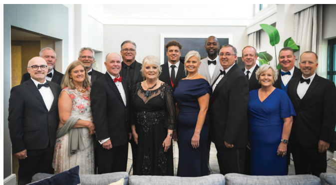
The 2025 IAAO Board of Directors