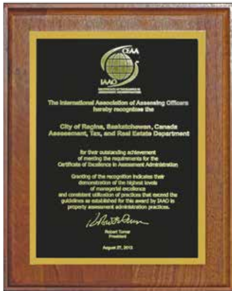
The CEAA plaque recognizes the completion of the certificate program

“The CEAA application process provided an excellent opportunity to analyze every function of our office.”